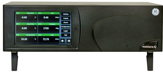
Bench Mount Version

The moisture.IQ can accept inputs from the Panametrics MIS probes and the M Series probes that were available for the Moisture Image Series 1 and Moisture Monitor Series 3 analyzers. The MIS probes (MISP and MISP2) provide integral moisture, temperature, and pressure inputs. The calibration data for these sensors is stored digitally. Upon connection to the analyzer, the calibration data is downloaded to the moisture.IQ.