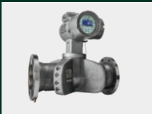
Sentinel LCT8 Eight-path accuracy under changing conditions