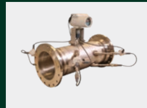
Sentinel LNG Buffered transducers for cryogenic measurement