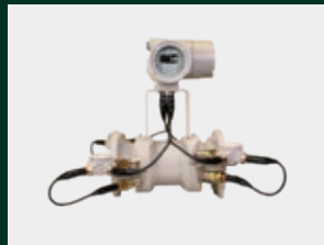
Sentinel LCT Buffered transducers for extended temperature range