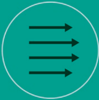
Traditional 4-path design

Eight paths also mean faster response for monitoring and analyzing processes. This minimizes downtime for yield management and asset protection, while providing actionable data when issues occur.