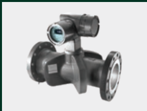
Sentinel LCT4 Optimized, cost-effective four-path design