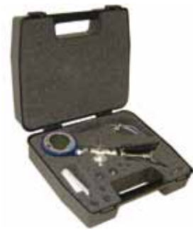
Pneumatic test kit