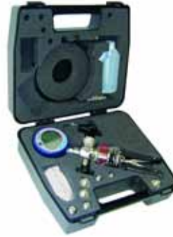
Hydraulic test kit

Includes: DPI 104-IS; ranges to 300 psi (20 bar), PV 211 pneumatic test pump, hose, adaptors, seal kit and case.