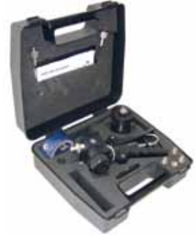
Pneumatic and hydraulic test kit