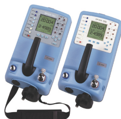
DPI 610 Aeronautical