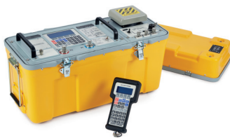
ADTS 405 MKII