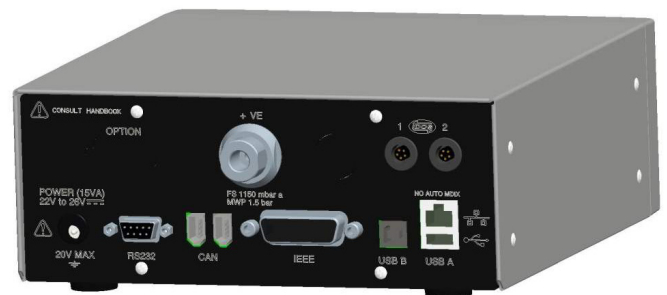
PACE1001 from the rear