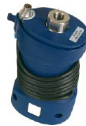
External IDOS universal pressure module